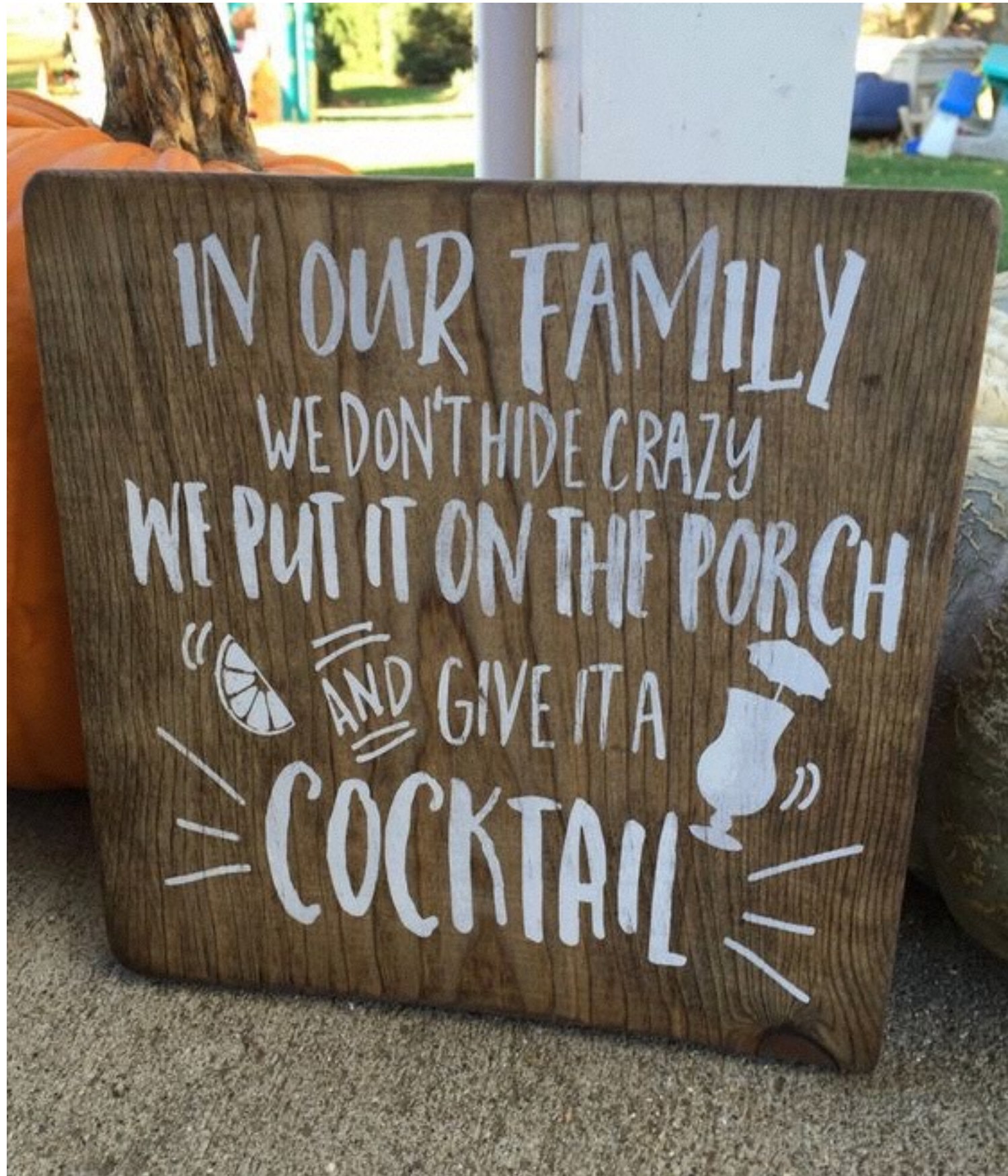
Sign by TheSparkleBarn