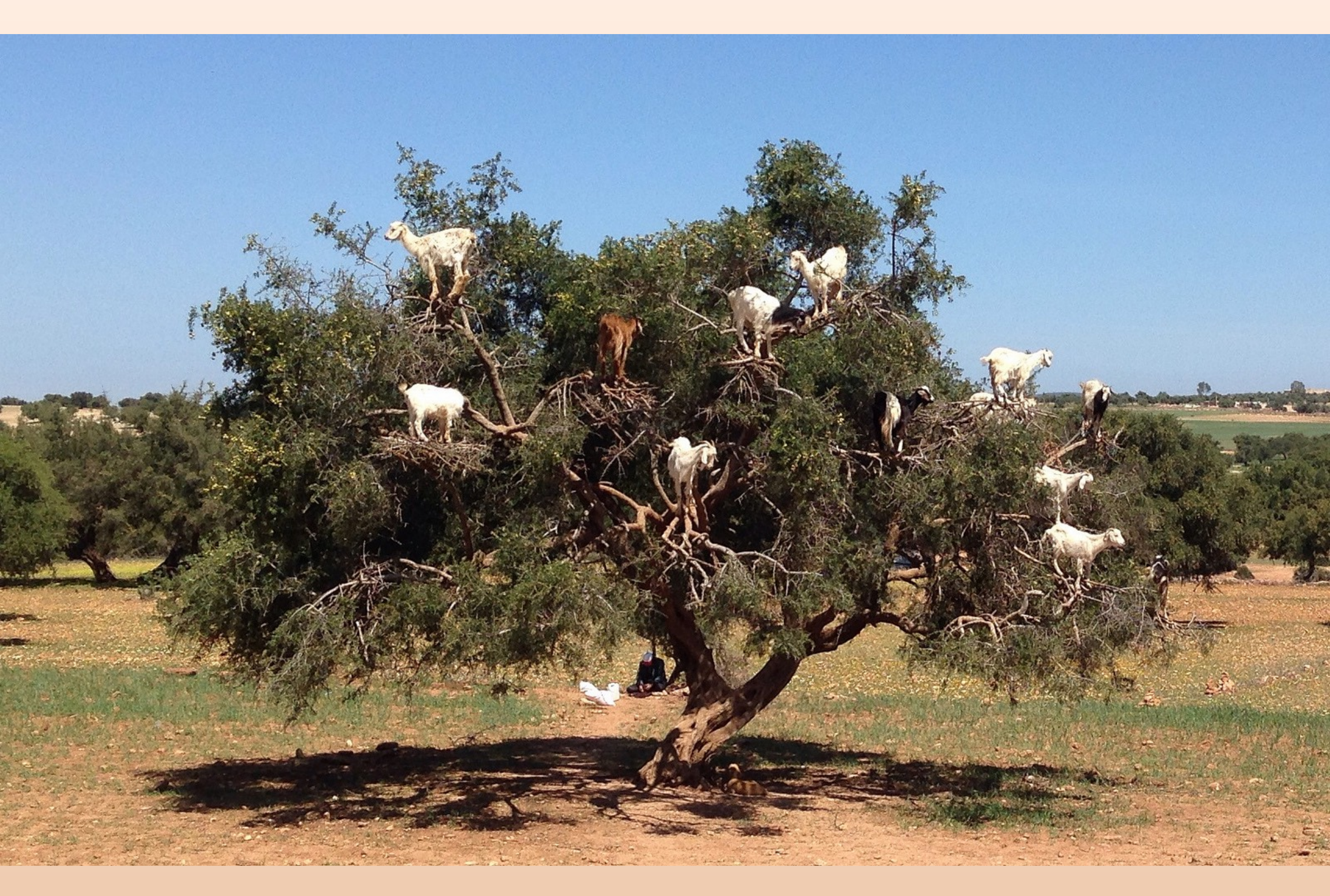
"goats on Argan tree" by Yellow Magpie (creative commons).