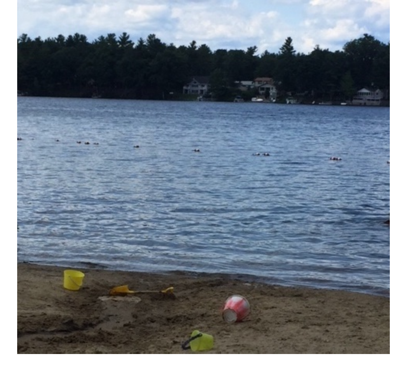
BEACH DAY! Sunday August 20 from Noon to 2 pm.

Please bring your families and a packed lunch to Edwards Beach in Westford. (this is a different beach from the one where we had the Easter sunrise service). Romp in the water, which should be above freezing by August! Kick back with your church buds and make new friends! There is a playground adjoining Edwards Beach, so little kids can choose between surf and turf. Remember to bring beach shoes (the sand is not soft) and a chair!