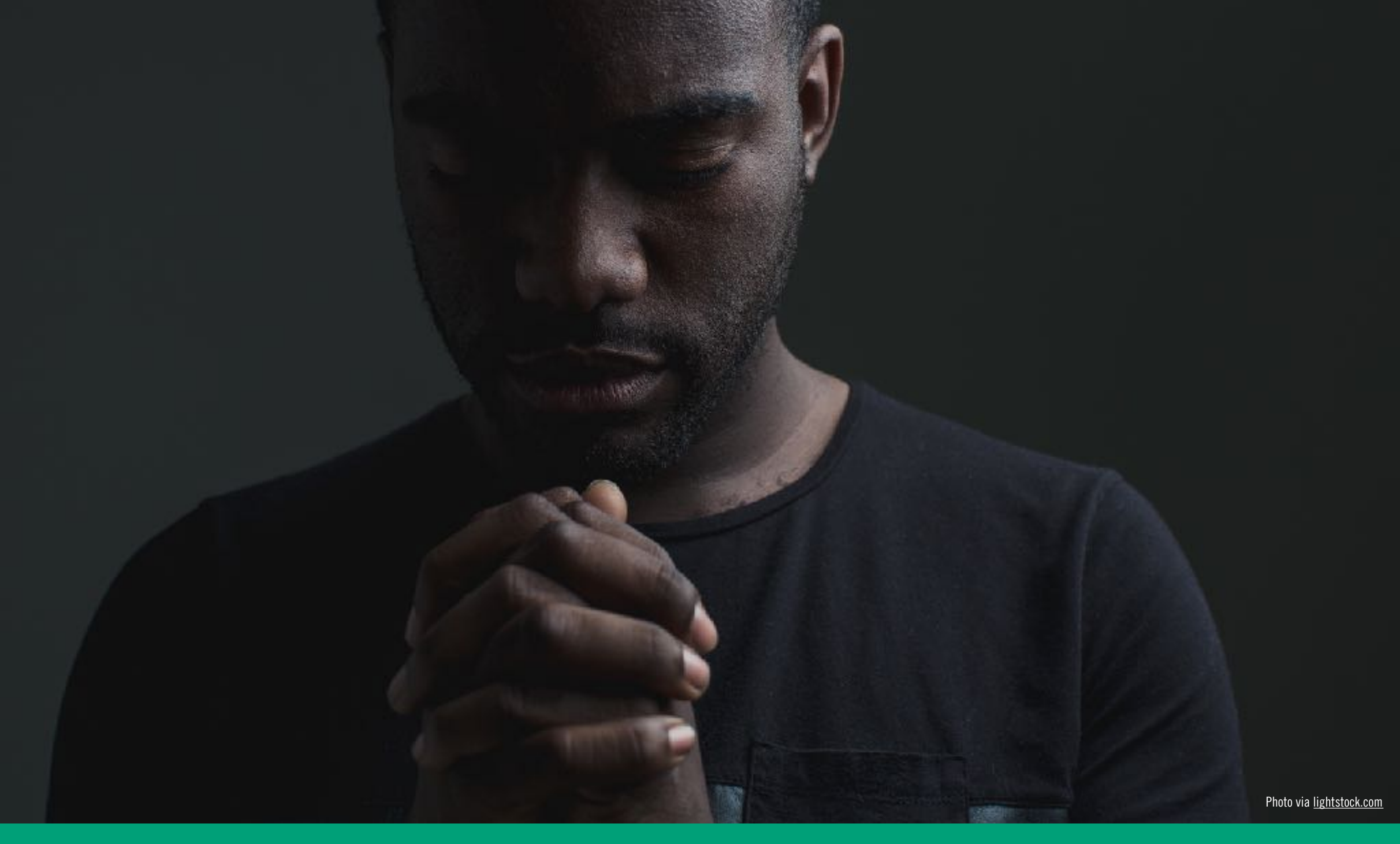
Discipleship 101: The Praying Disciple Philippians 1:3-11