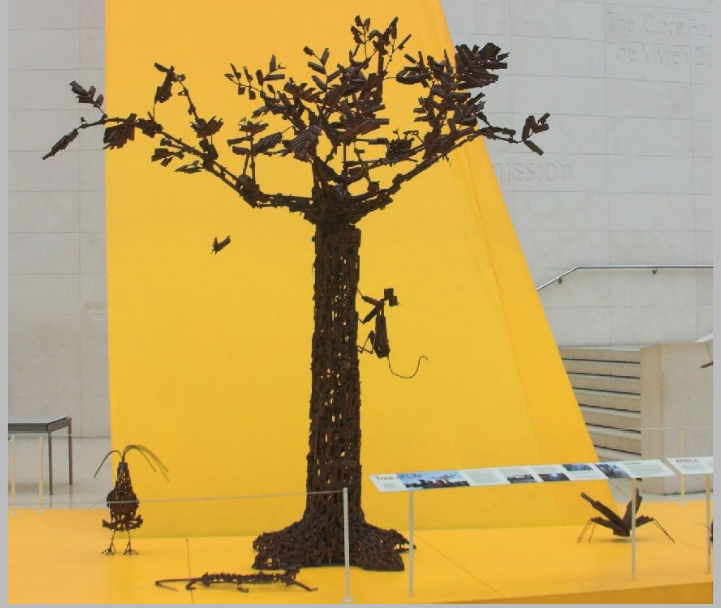
By Rob Roy from Watford, Hertfordshire (NW London), United Kingdom - Tree of Life and creatures, British Museum, CC BY 2.0, <a href="https://commons.wikimedia.org/w/index.php?curid=11855286">https://commons.wikimedia.org/w/index.php?curid=11855286</a>