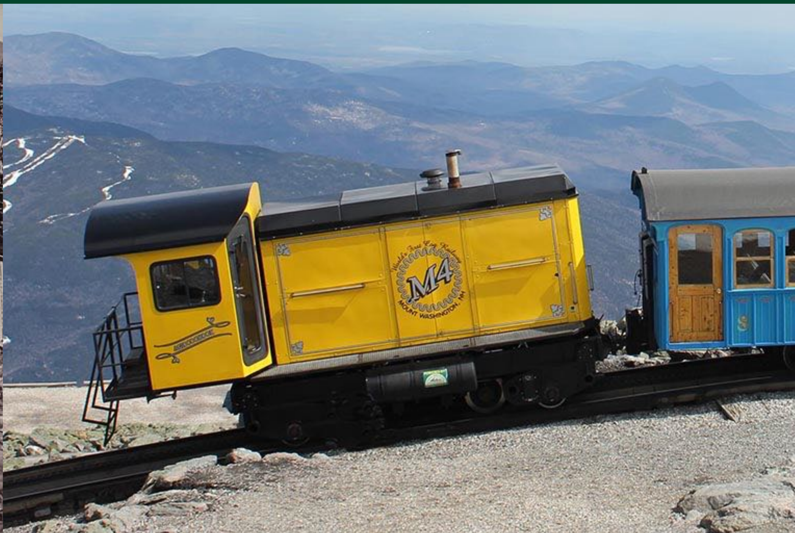
Opening day train ride at Mount Washington Cog Railway, April 2013