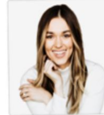
Sadie Robertson Huff